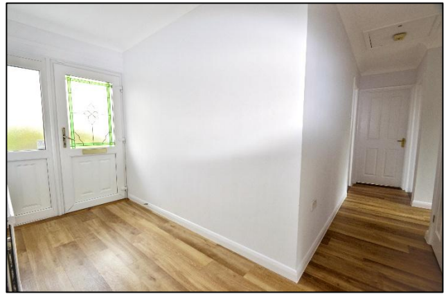
LIVING ROOM/DINER 6.96m (22'10") x 3.66m (12'0")

An L-shaped hallway with radiator, door to airing cupboard housing a hot water tank with immersion and storage within, plastered and coved ceiling with ceiling light and loft trap with access to the roof space, recent LVT flooring, doors to living room, kitchen, bathroom and the three bedrooms.