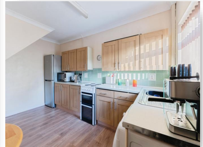
The Boulevard, Great Sutton Ellesmere Port CH65 7DX