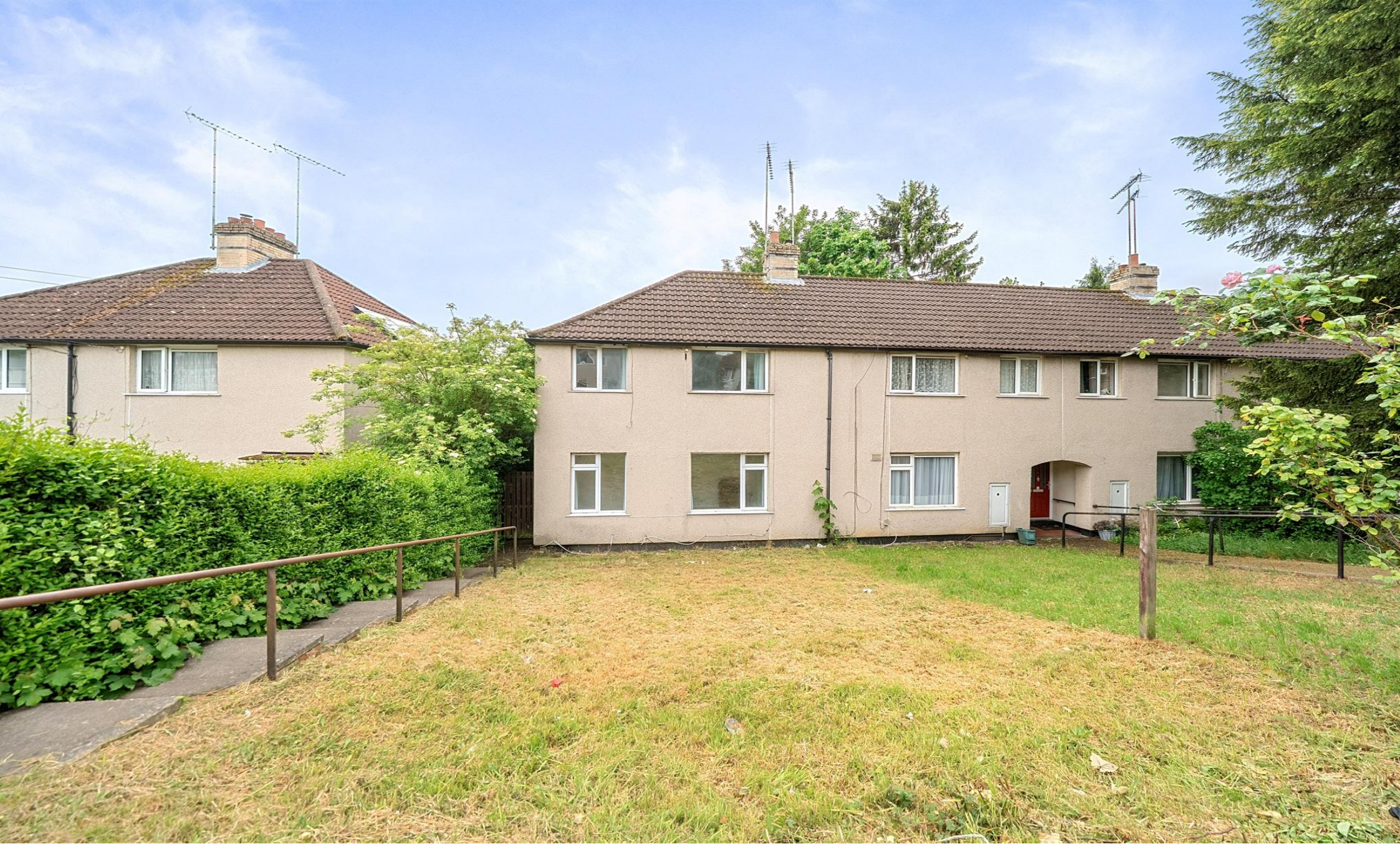
Dellfield, St. Albans AL1 5HB