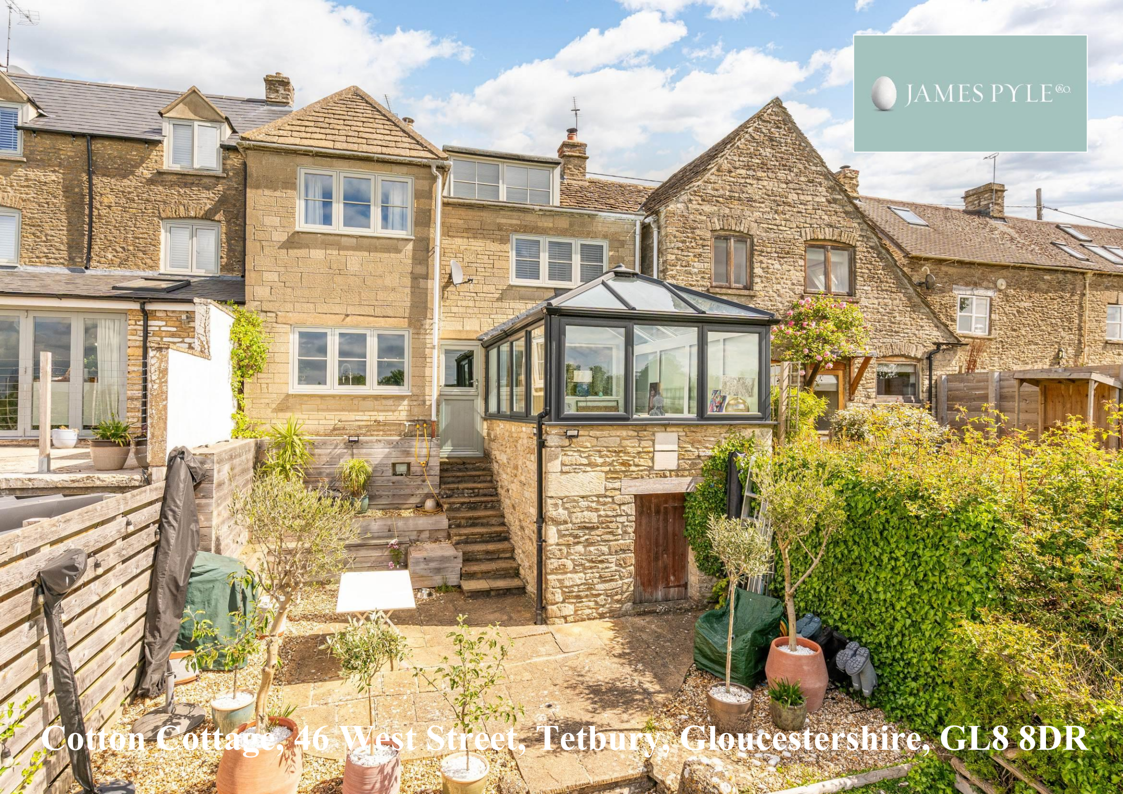
Cotton Cottage, 46 West Street, Tetbury, Gloucestershire, GL8 8DR