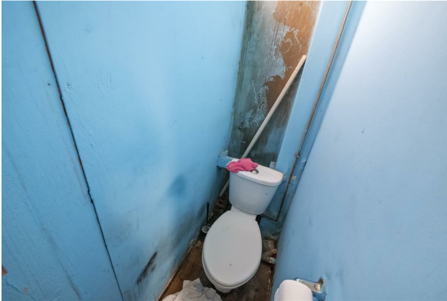
'C' 2 Bed First Floor Flat