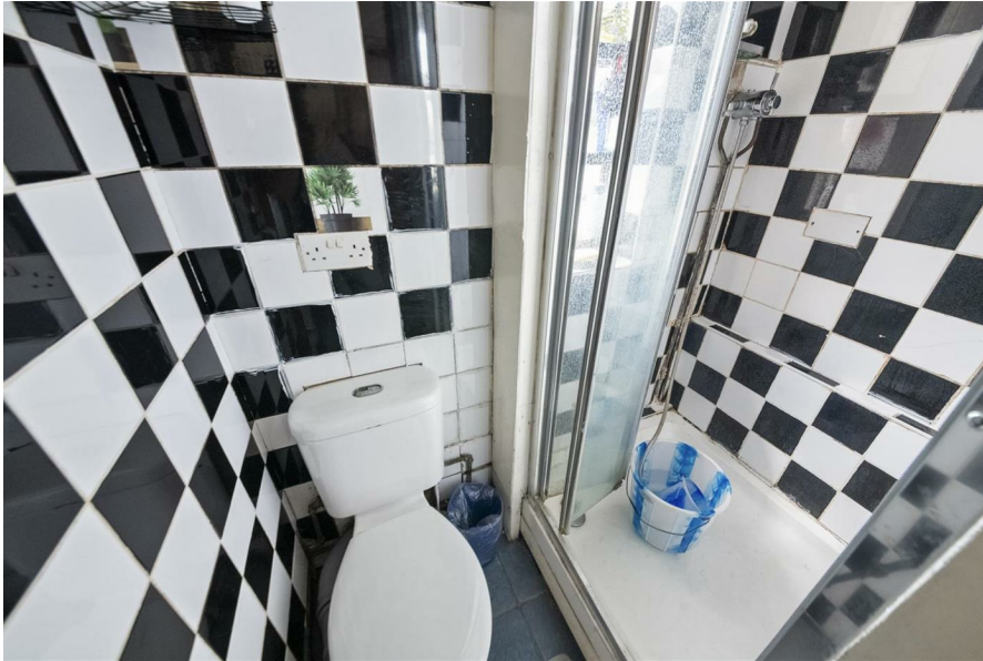
'B' Ground Floor Studio