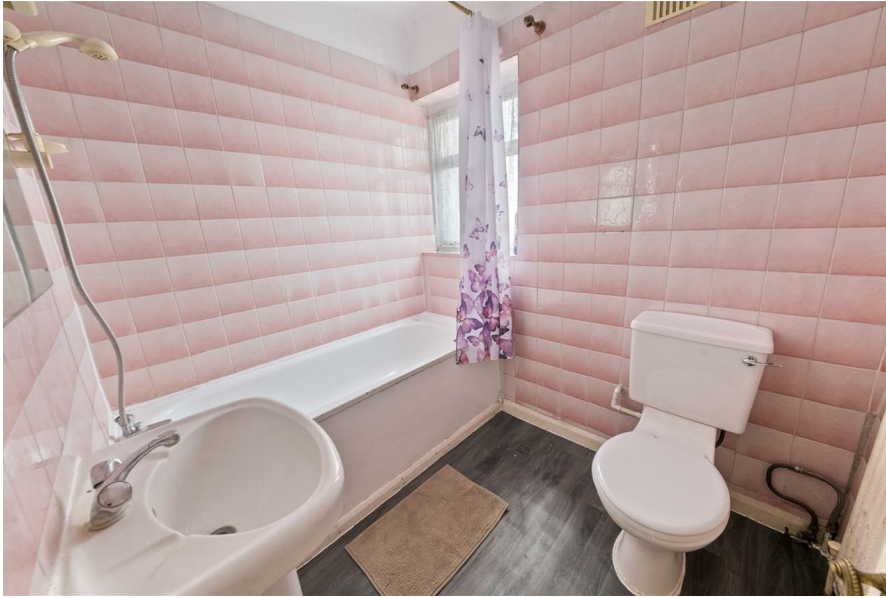
No.61 'A' Ground Floor Studio