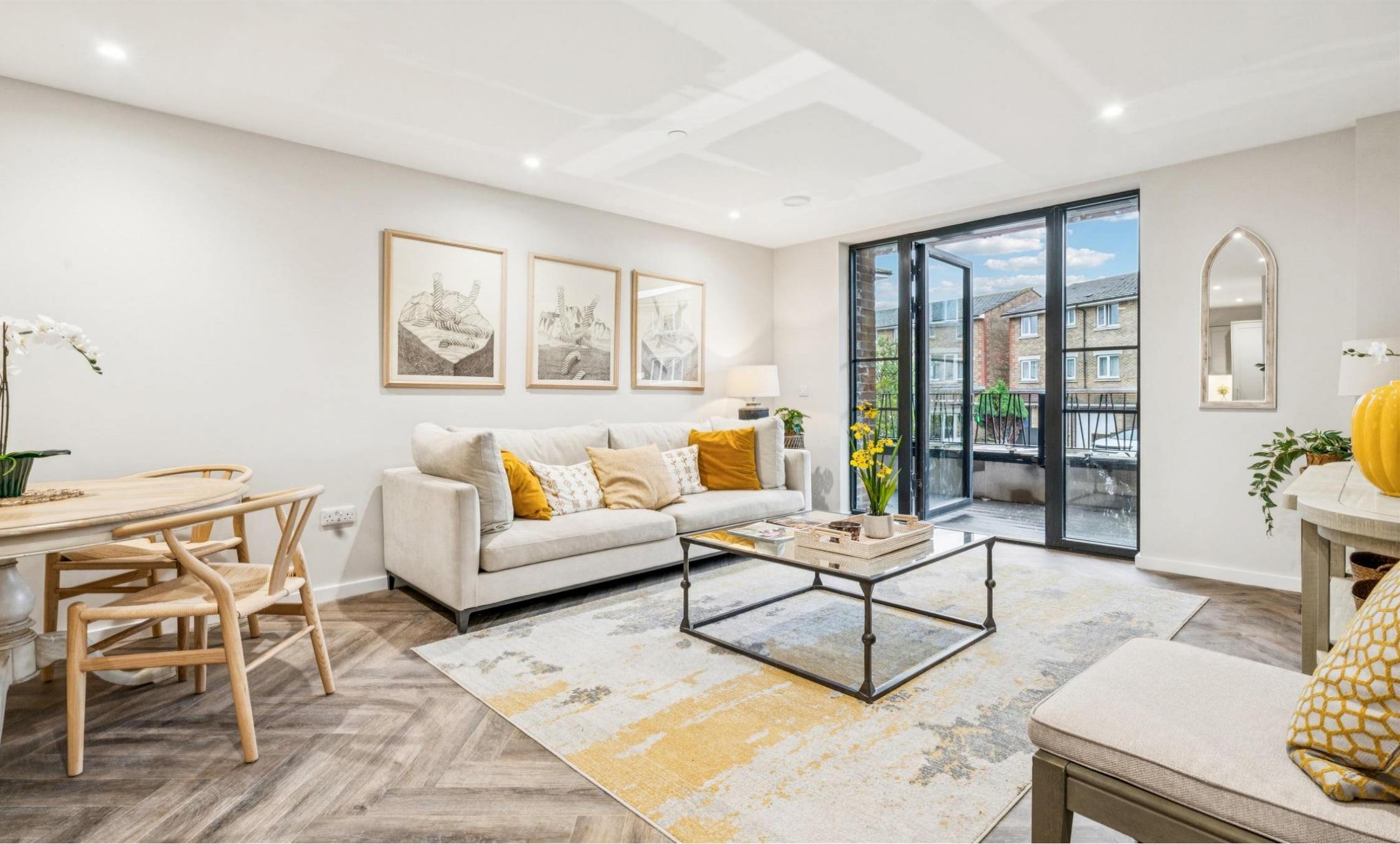
Meadow House Fallsbrook Road, London SW16 6DY