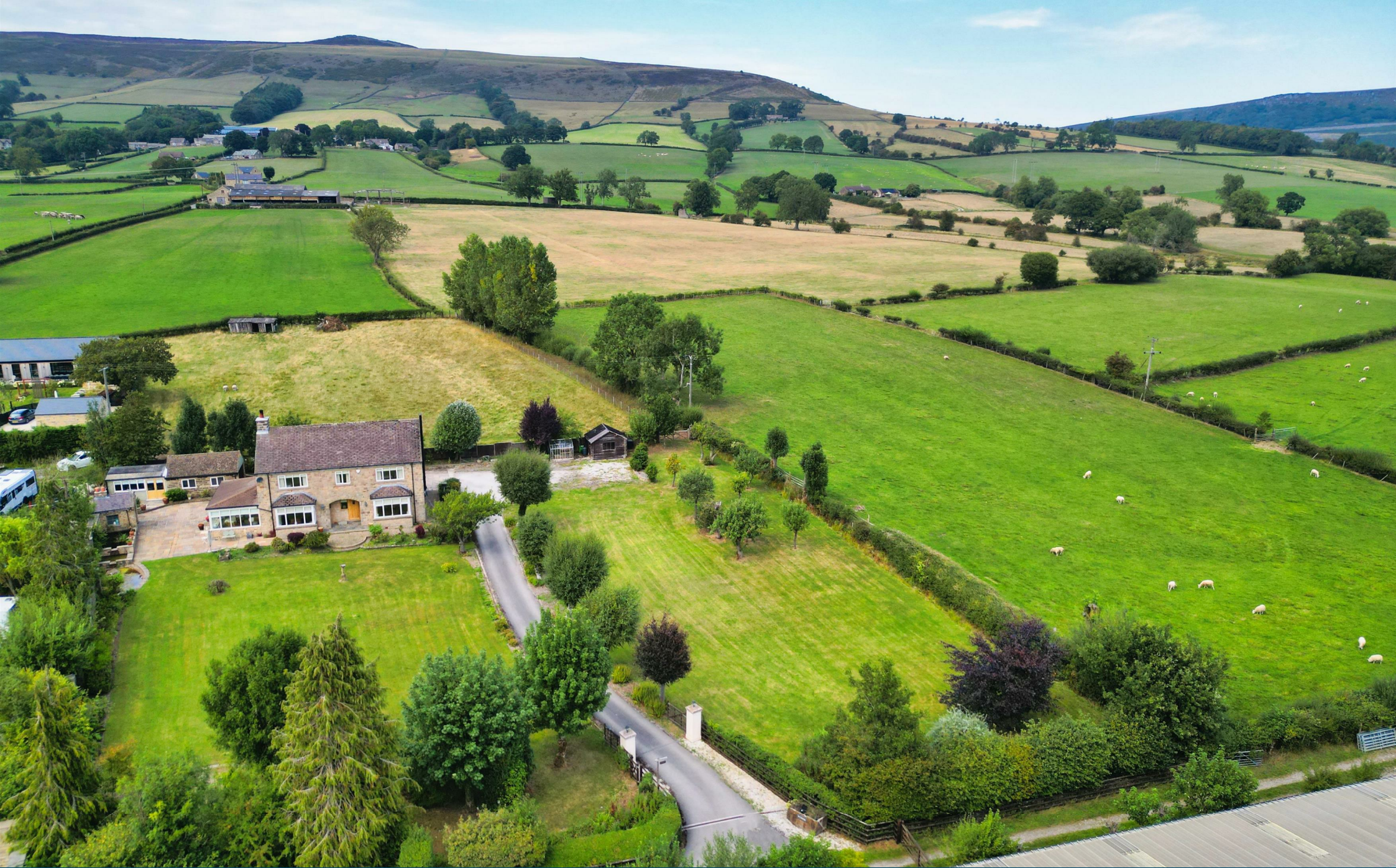
Wynook, Parsons Lane, Aston, Hope Valley, Derbyshire, S33 6RB