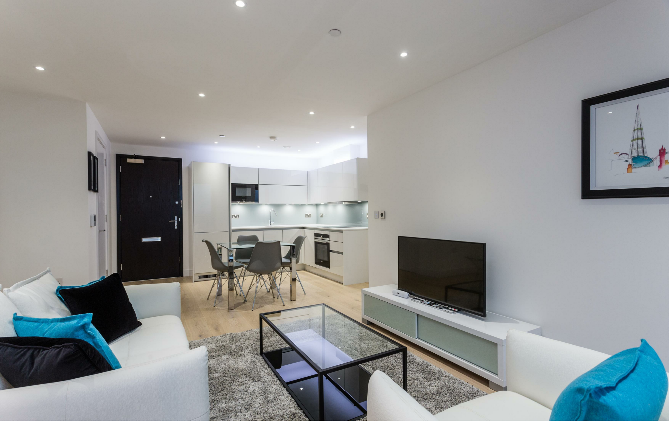
1305 Heritage Tower London, E14 3NW £600 Per Week