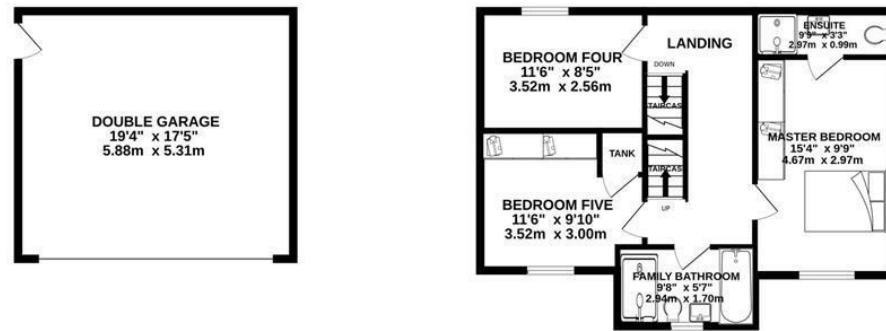
1ST FLOOR 570 sq.ft. (53.0 sq.m.) approx.