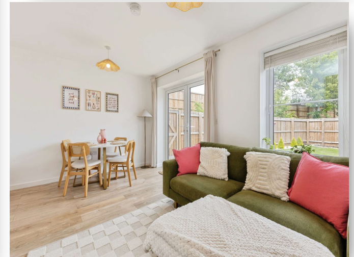
Carnation Close, Attleborough NR17 1SP