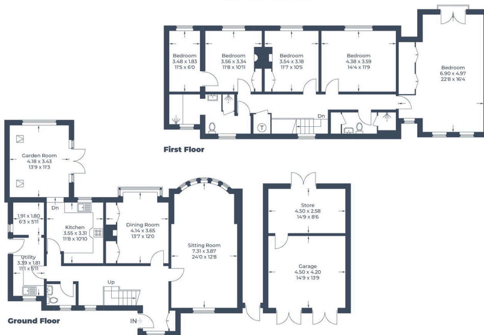
Illustration for identification purposes only, measurements are approximate, not to scale. © CJ Property Marketing Produced for EXP - Kate Woodward