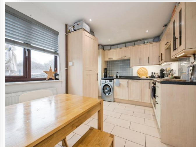
Cerne Close, West End, Southampton SO18 3NG