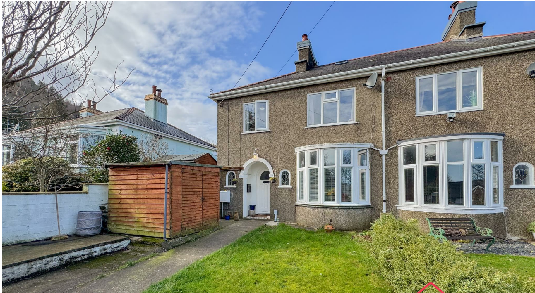
Hill View Crescent Road, Ramsey, IM8 2JR Asking Price £359,950