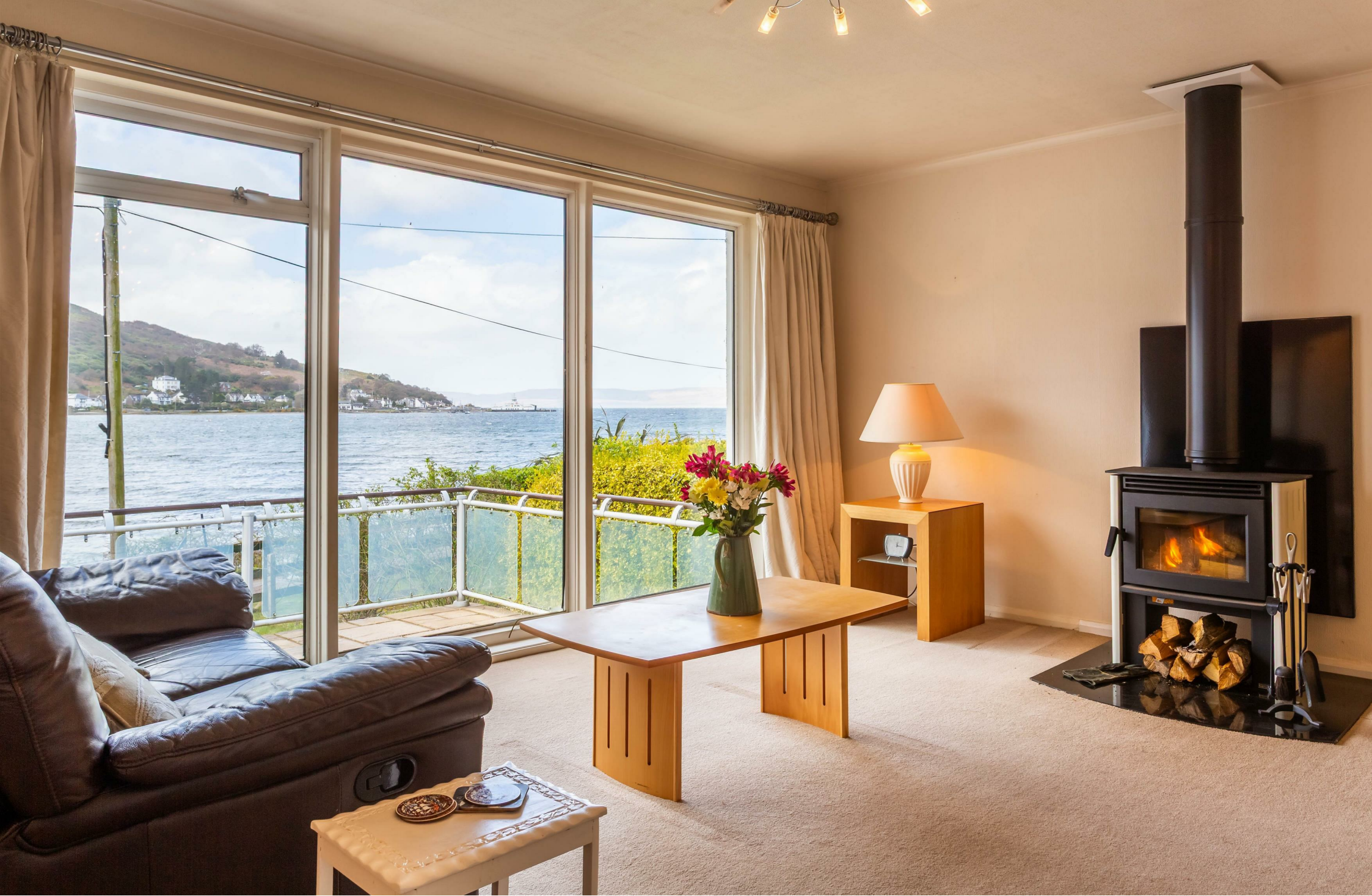
Lochside House Lochranza, Isle Of Arran, KA27 8JF