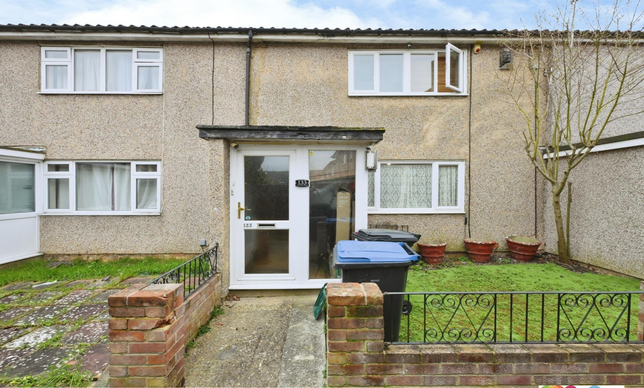
Joyners Field, Harlow CM18 7QA