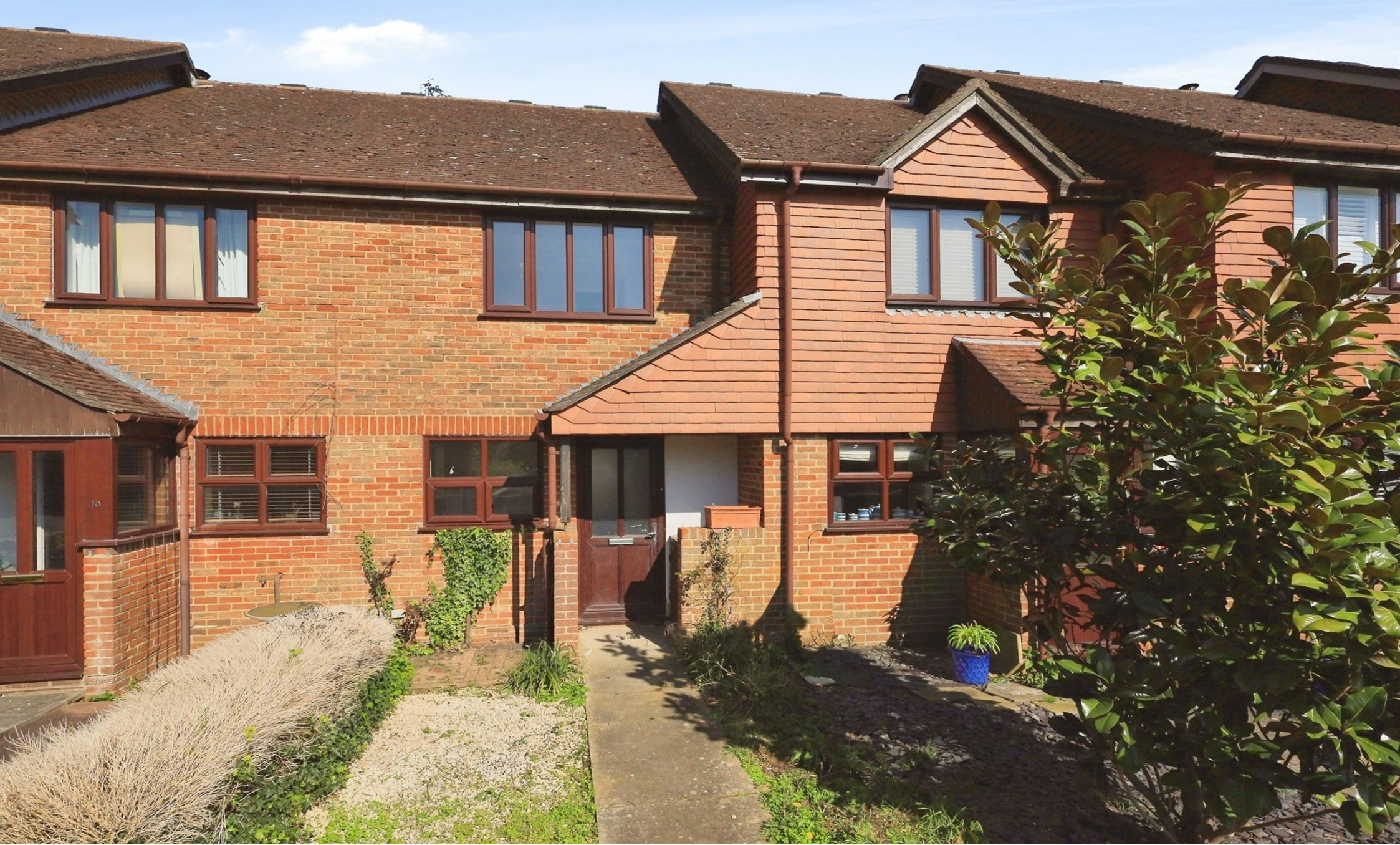
The Grange, Barcombe Lewes BN8 5AT