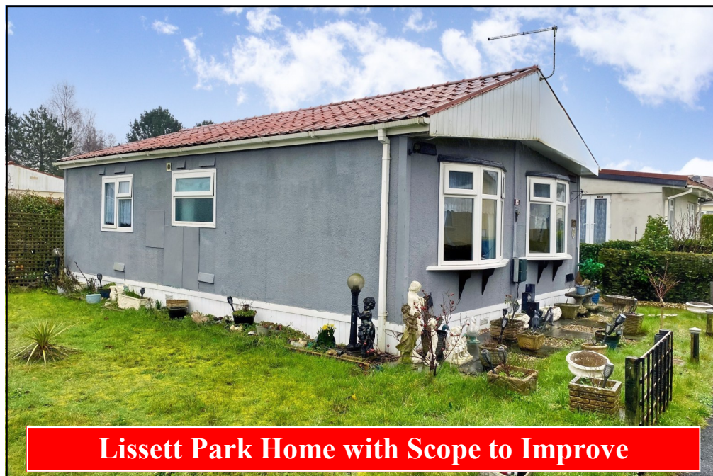
Lissett Park Home with Scope to Improve

34 Gladelands Park, Ringwood Road, Ferndown, Dorset. BH22 9BW