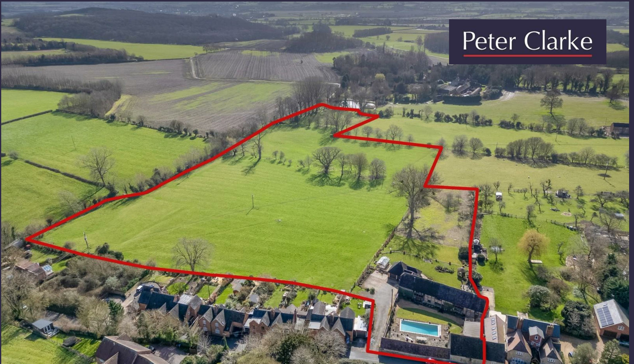
Longbarn Temple Grafton, Alcester, Warwickshire, B49 6NU