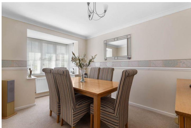
Dining Room 4.17m (13'8") max x 2.61m (8'7")