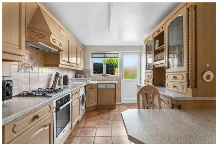
Kitchen 4.61m (15'1") x 2.61m (8'7")