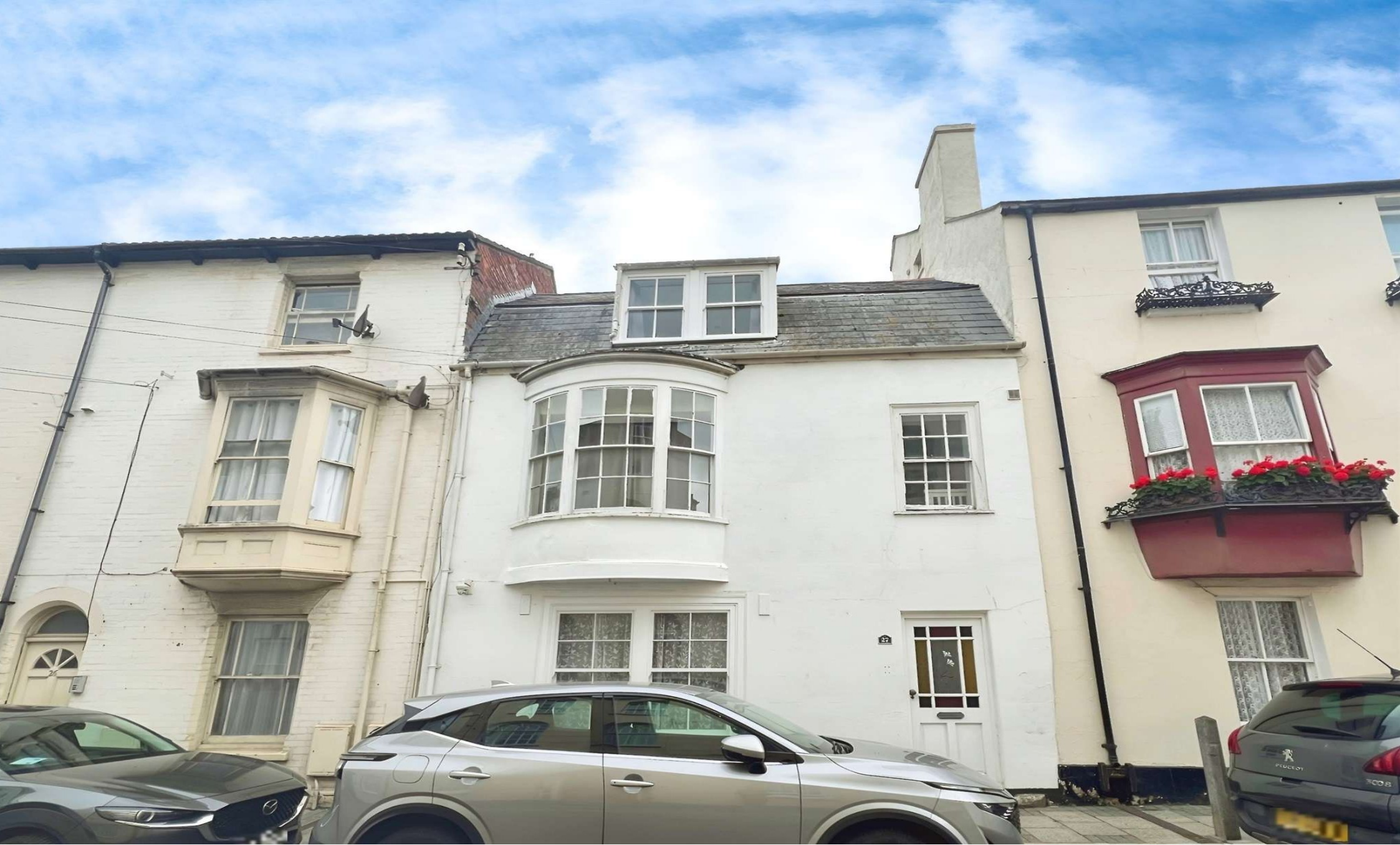
East Street, Weymouth DT4 8BN