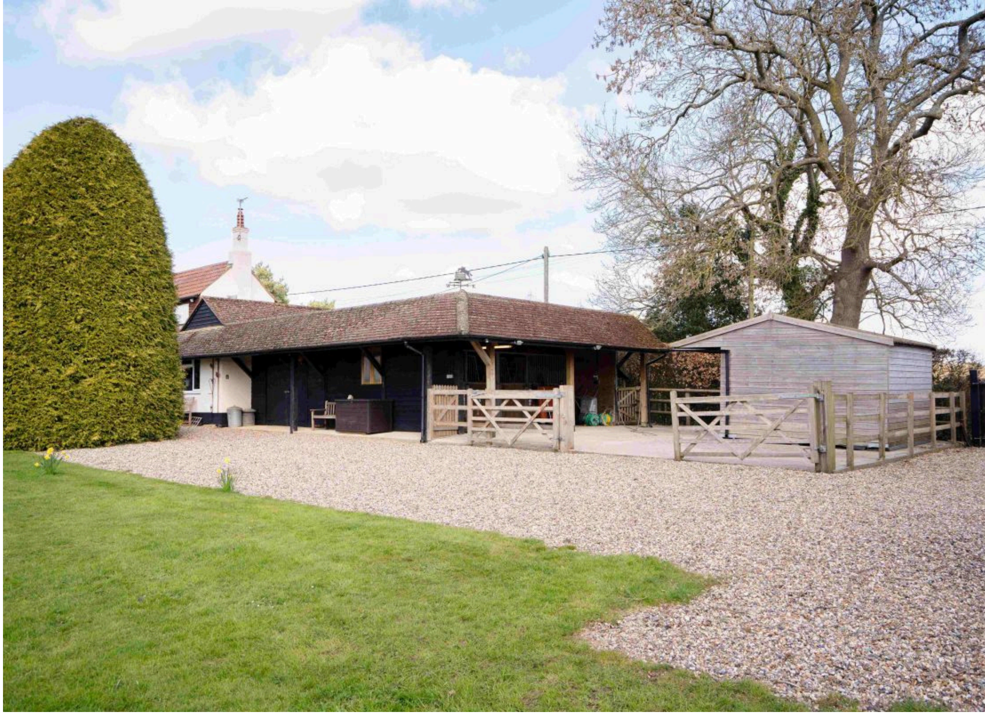
CORFIELD, ARREWIG LANE, CHESHAM