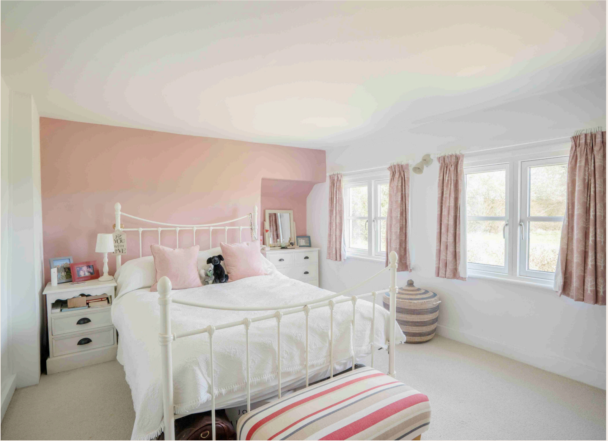
CORFIELD, ARREWIG LANE, CHESHAM