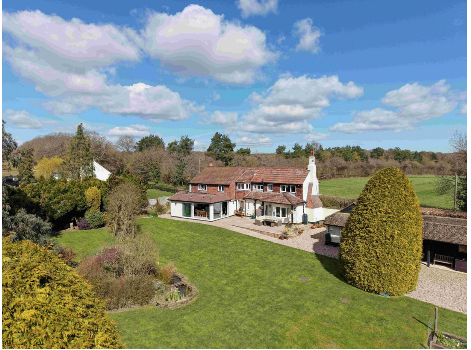
CORFIELD, ARREWIG LANE, CHESHAM