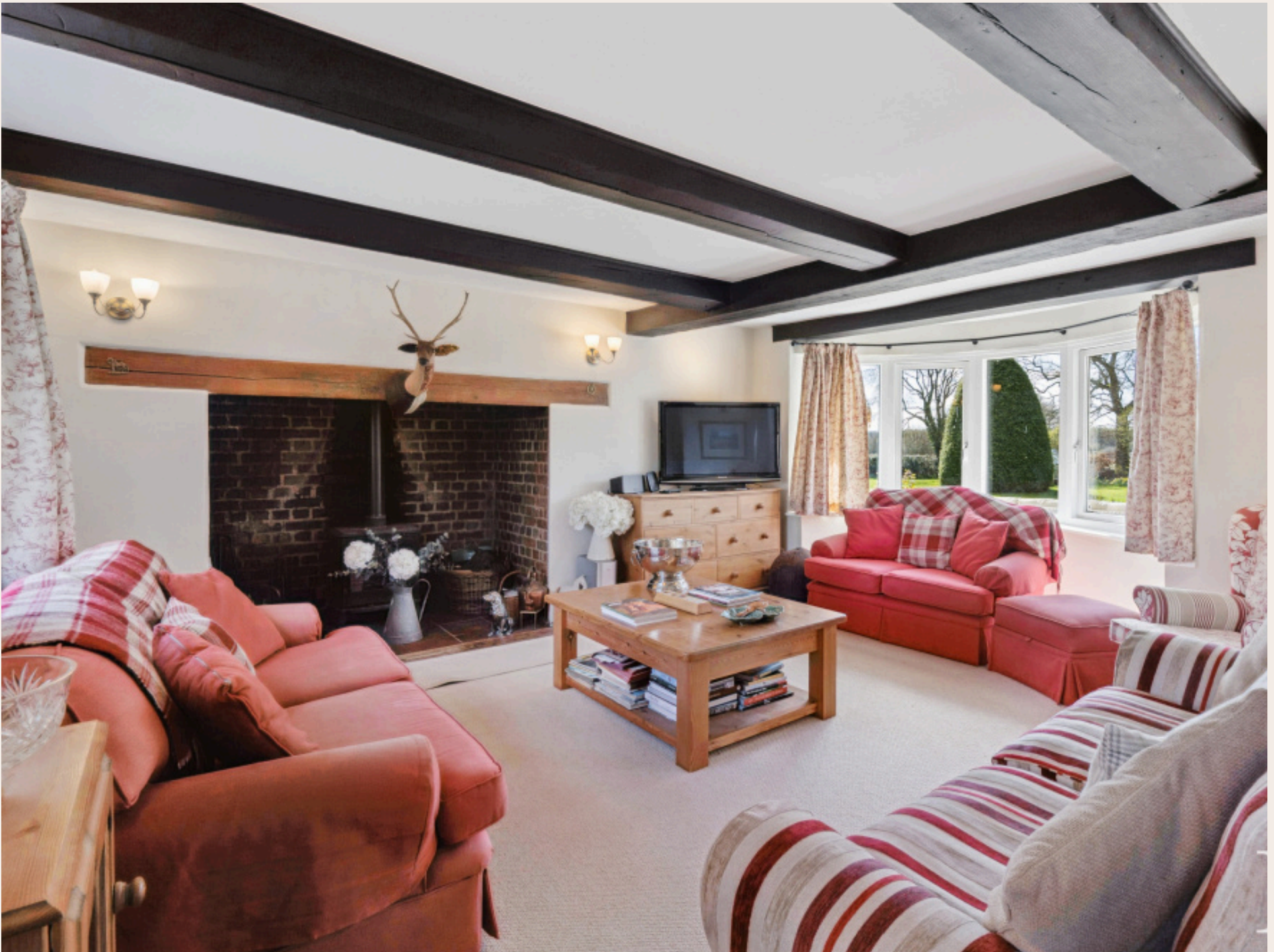
CORFIELD, ARREWIG LANE, CHESHAM