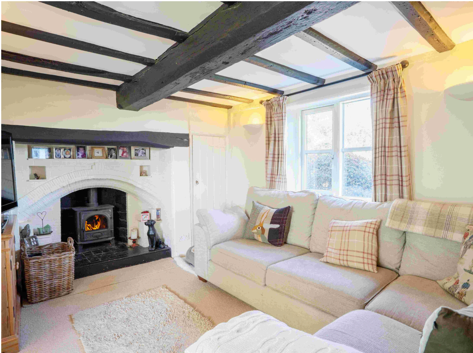
CORFIELD, ARREWIG LANE, CHESHAM