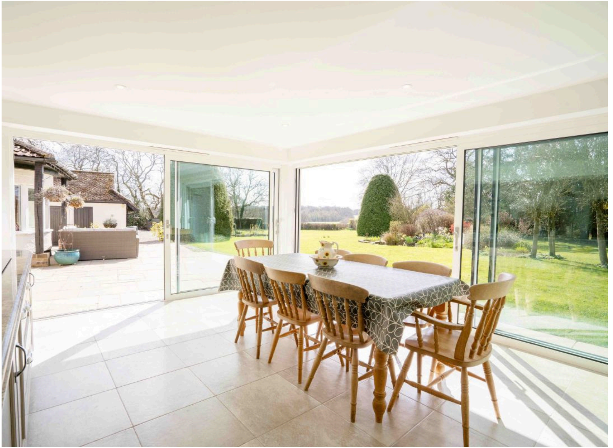
CORFIELD, ARREWIG LANE, CHESHAM