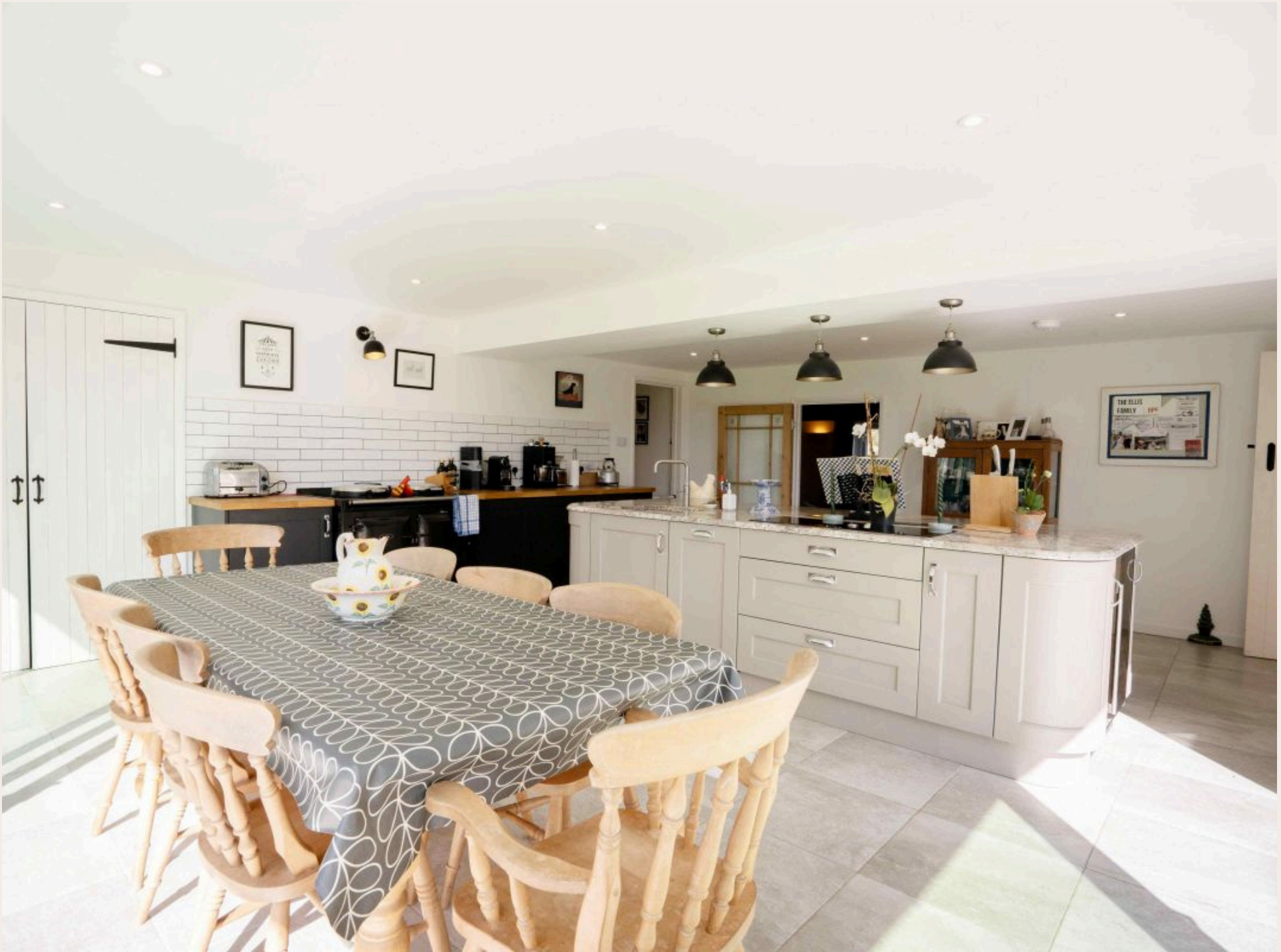
CORFIELD, ARREWIG LANE, CHESHAM