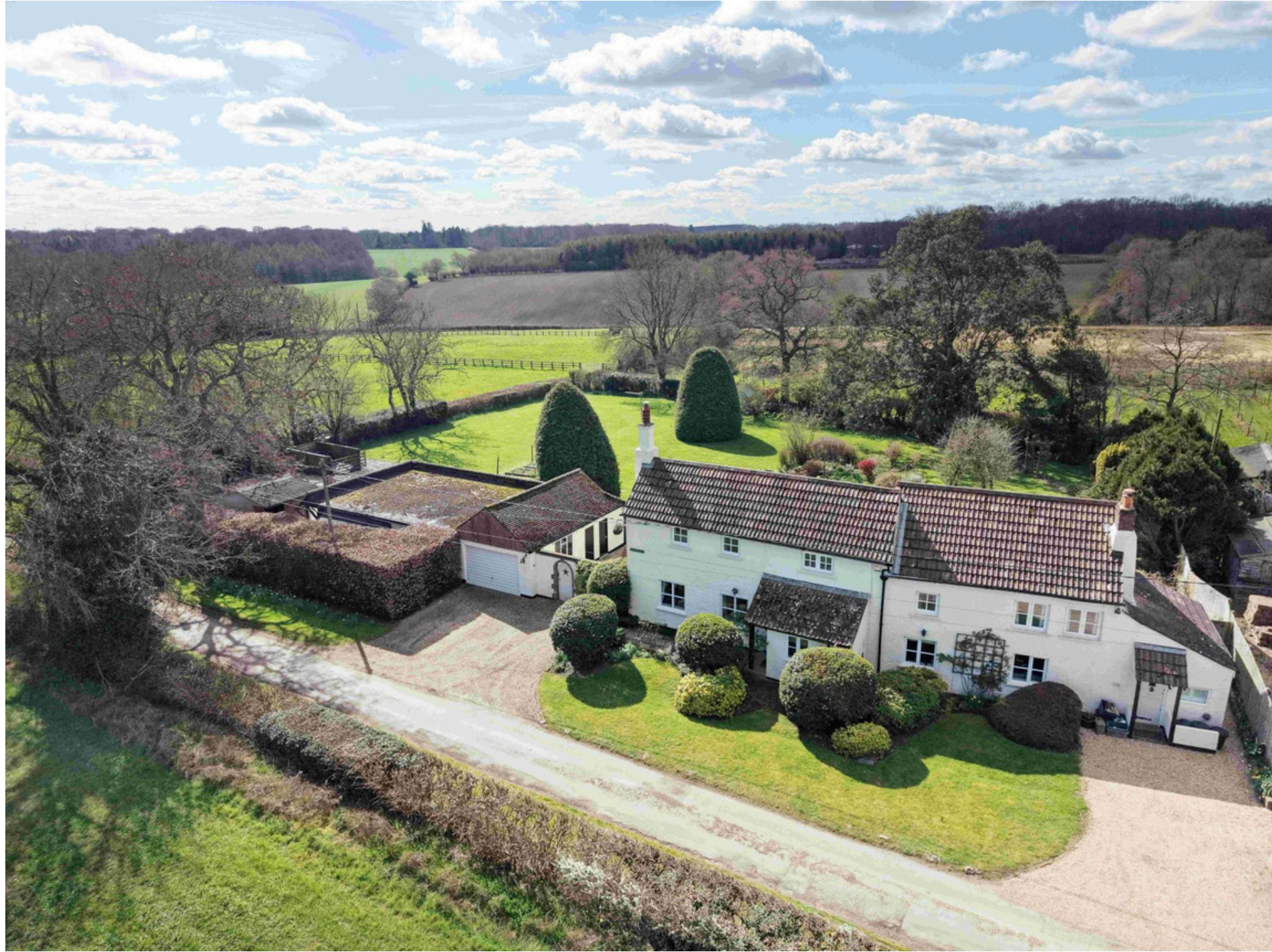
CORFIELD, ARREWIG LANE, CHESHAM