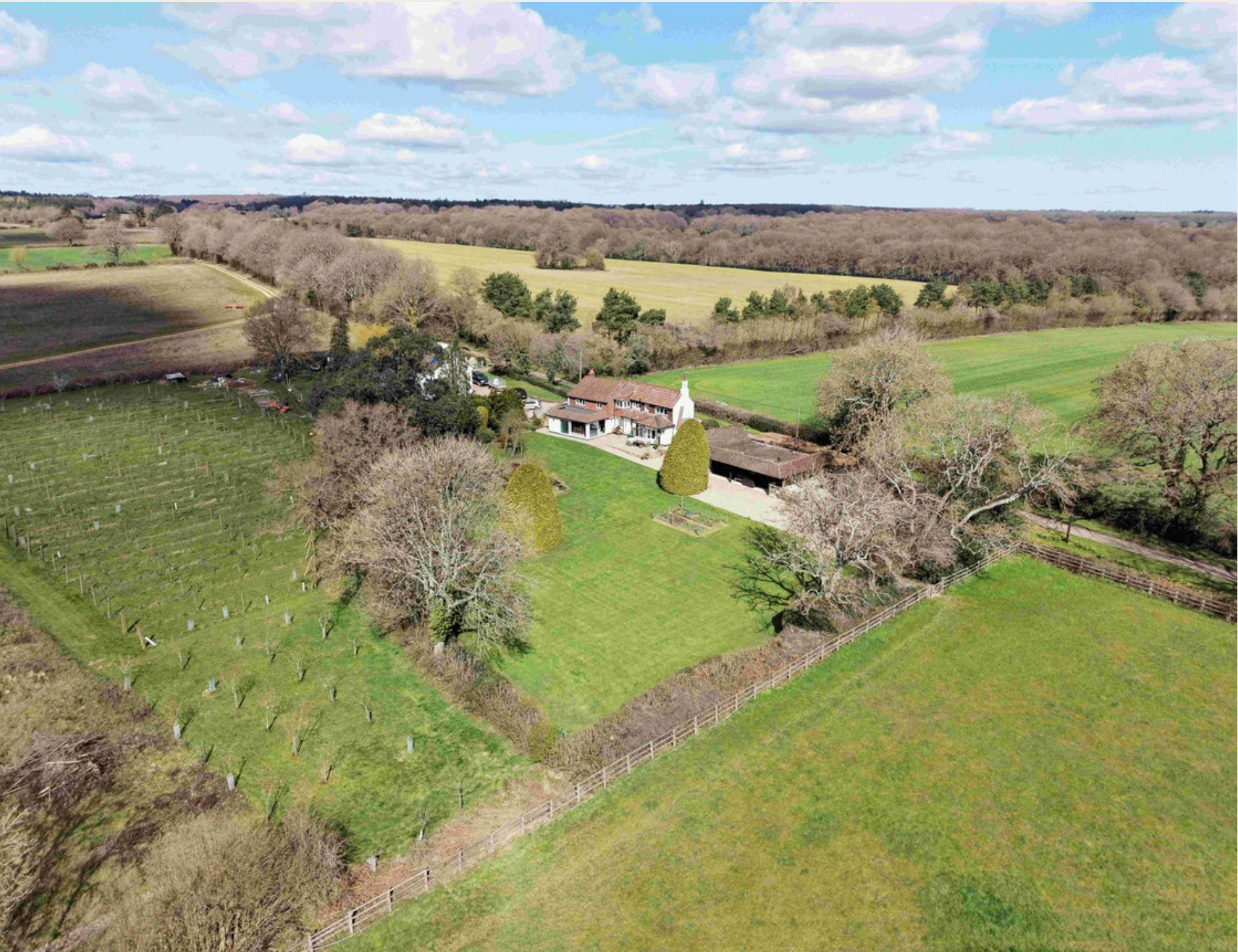
CORFIELD, ARREWIG LANE, CHESHAM