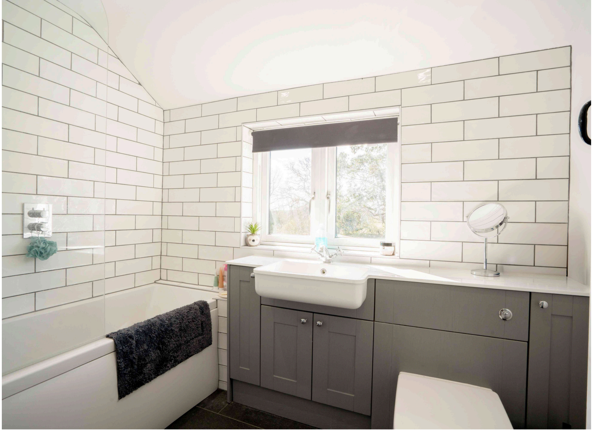
CORFIELD, ARREWIG LANE, CHESHAM