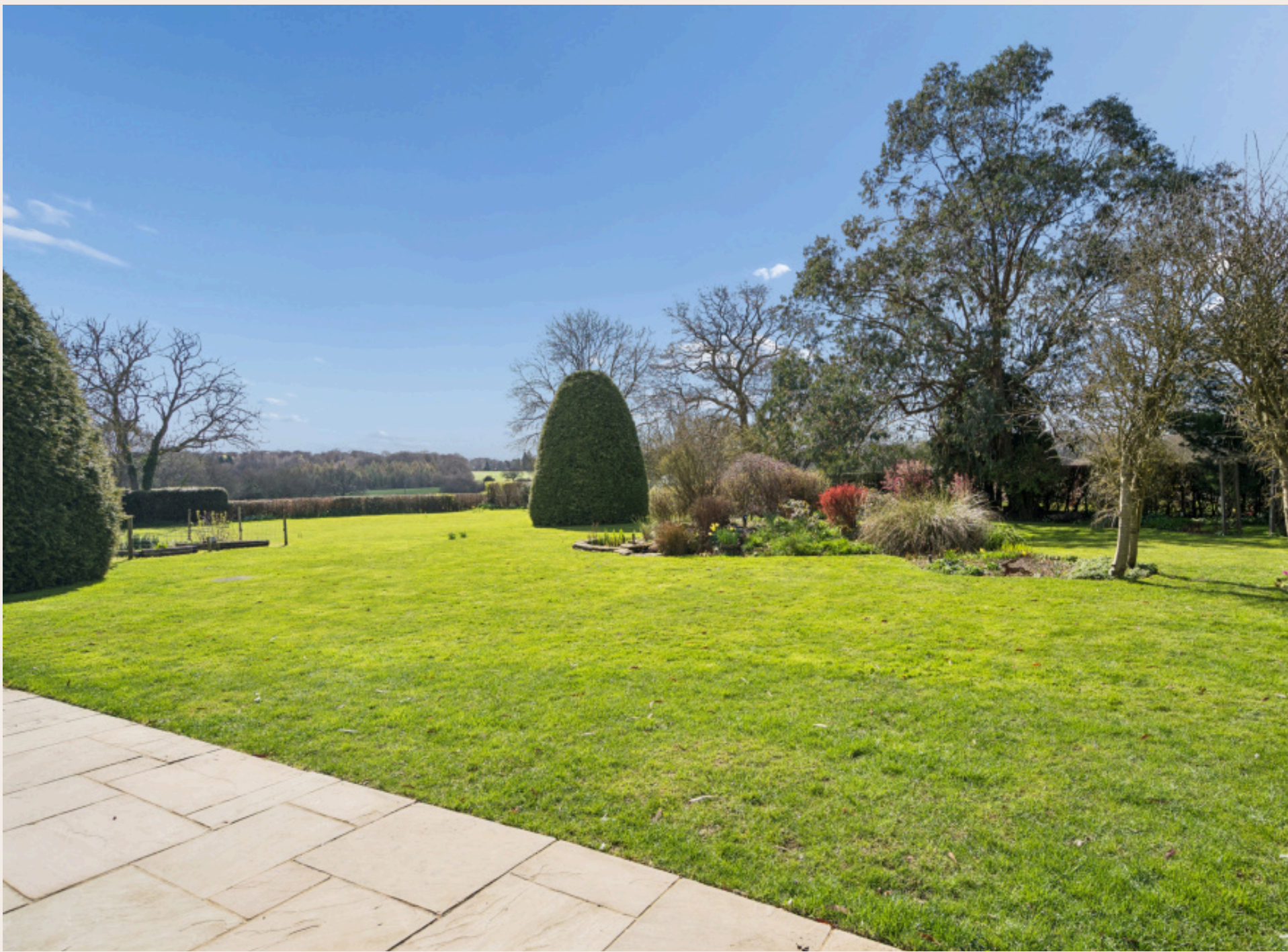
CORFIELD, ARREWIG LANE, CHESHAM