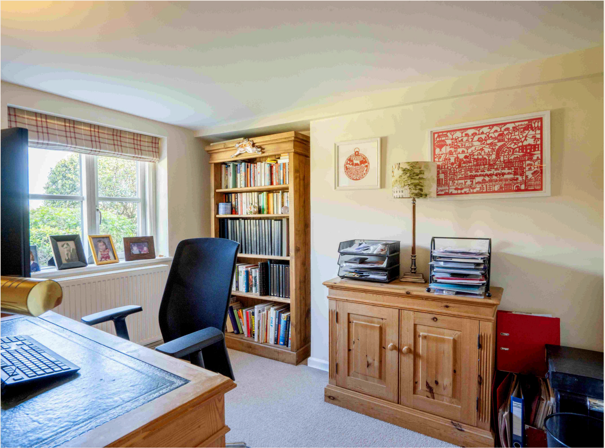
CORFIELD, ARREWIG LANE, CHESHAM