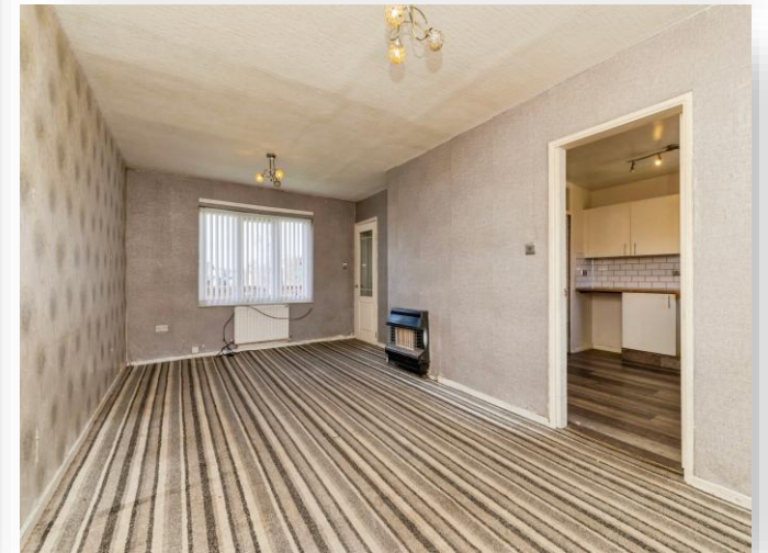
Braid Crescent, Billingham TS23 2QF