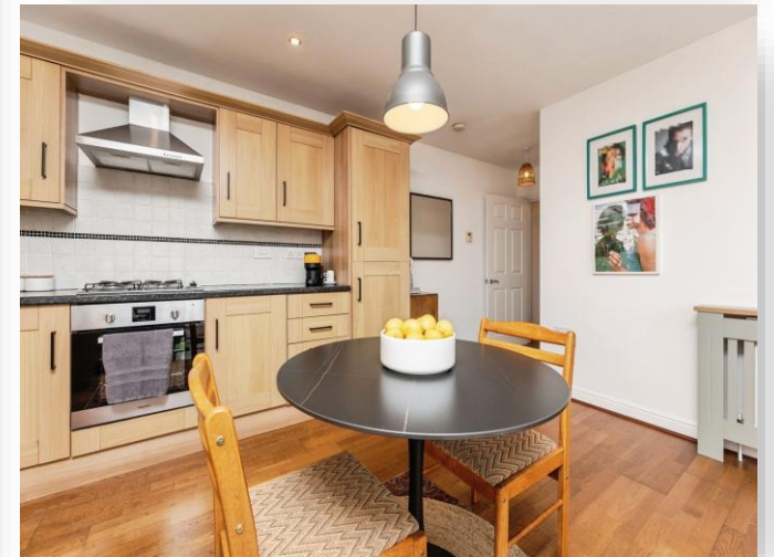
Sparta Court Troy Road, Morley Leeds LS27 8JG