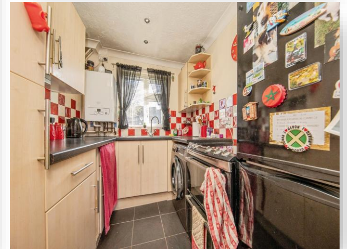
Aylward Close, Hadleigh, Ipswich, IP7 5SJ