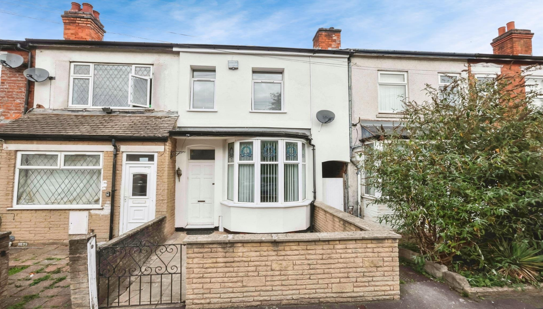
Deakins Road, Birmingham