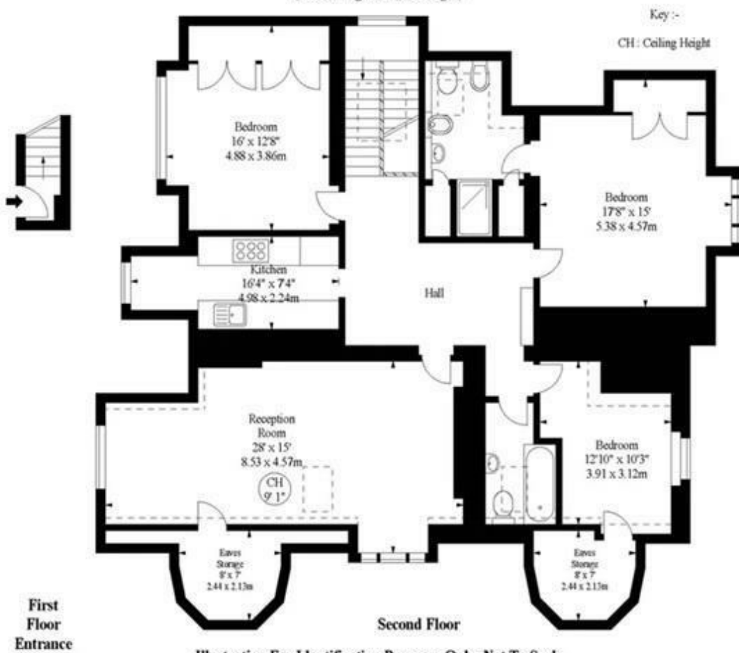
Illustration For Identification Purposes Only. Not To Scale

* As Defined by RICS - Code of Measuring Practice