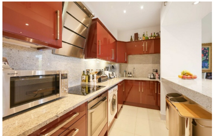
Airlie Gardens, W8