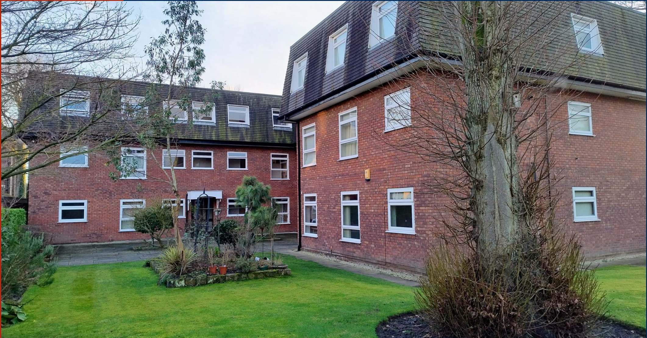
Flat 13 The Sycamores, Sale, M33 3WH