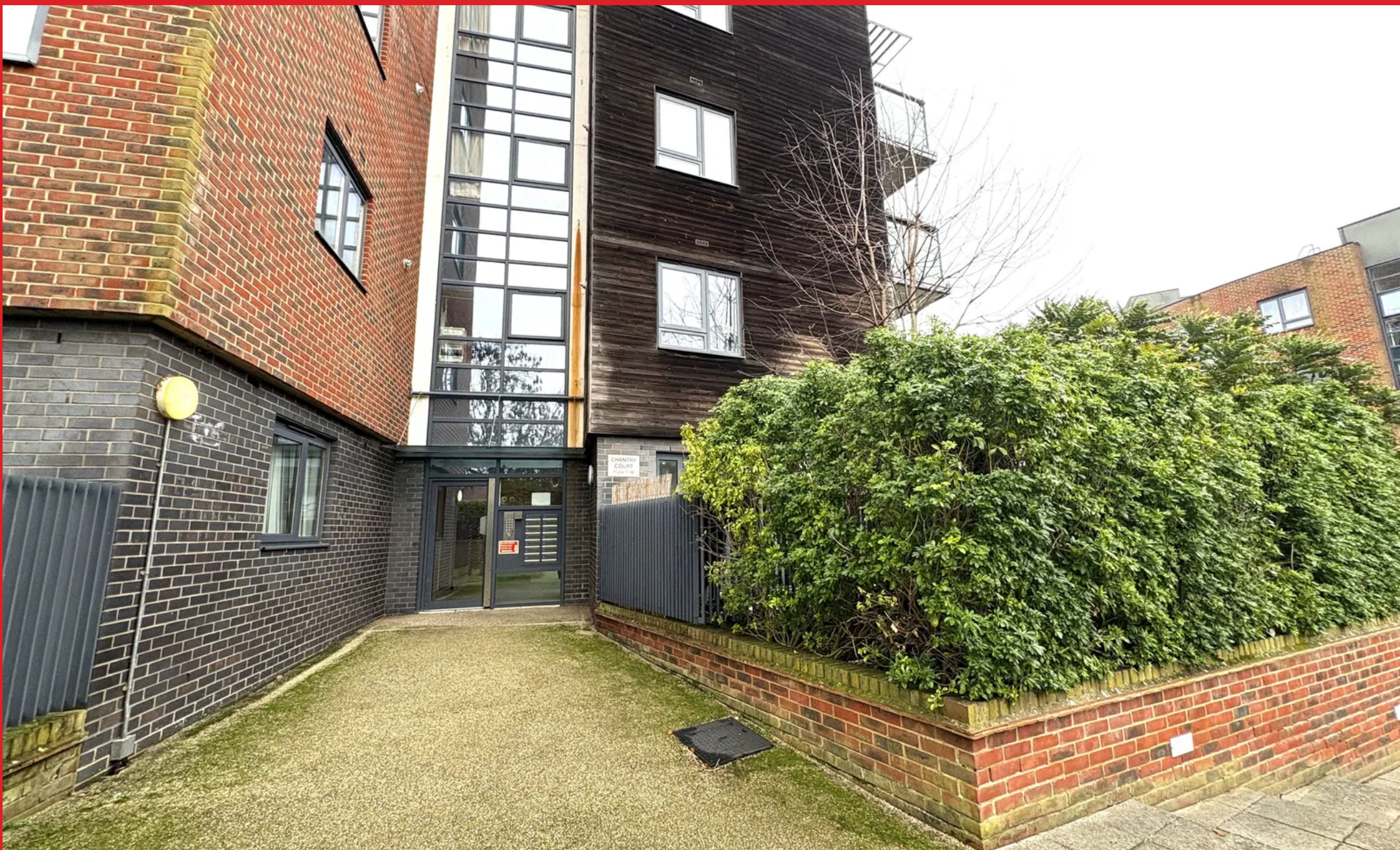
Penniwell Close, Edgware Edgware