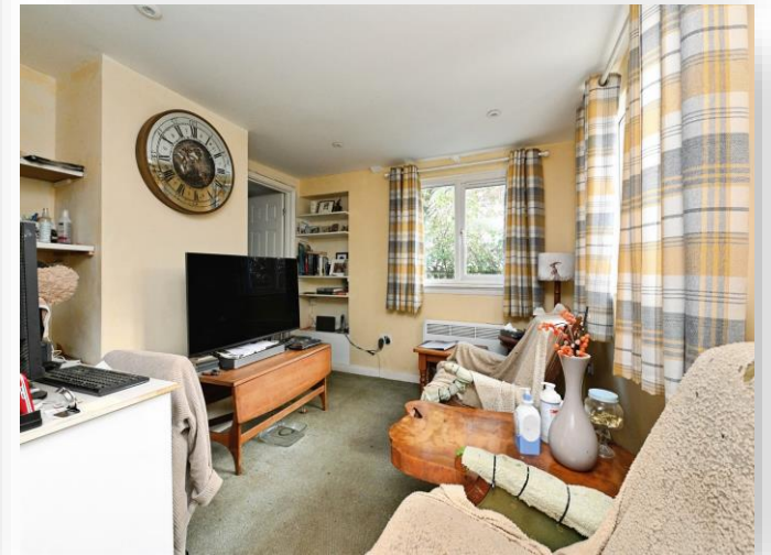
Basil Road, West Dereham, King's Lynn, PE33 9RP