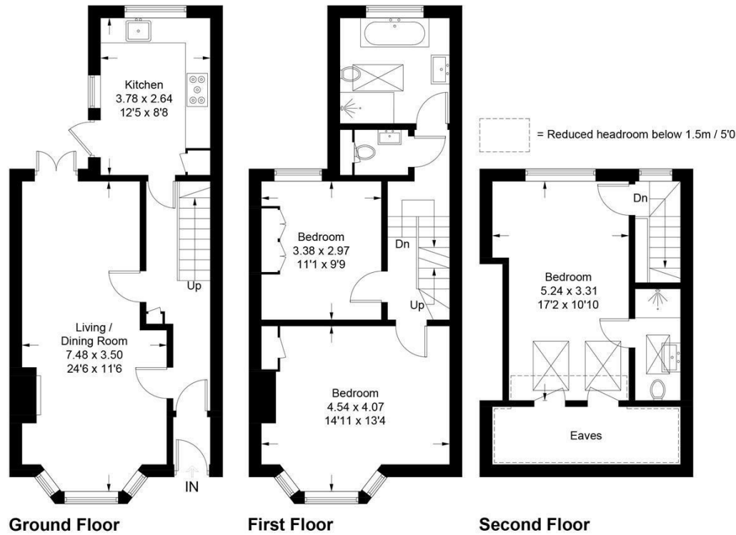
Illustration for identification purposes only, measurements are approximate, not to scale. Fourlabs.co © (ID1277417)

Approximate Gross Internal Area = 115.9 sq m / 1247 sq ft (Including Eaves)