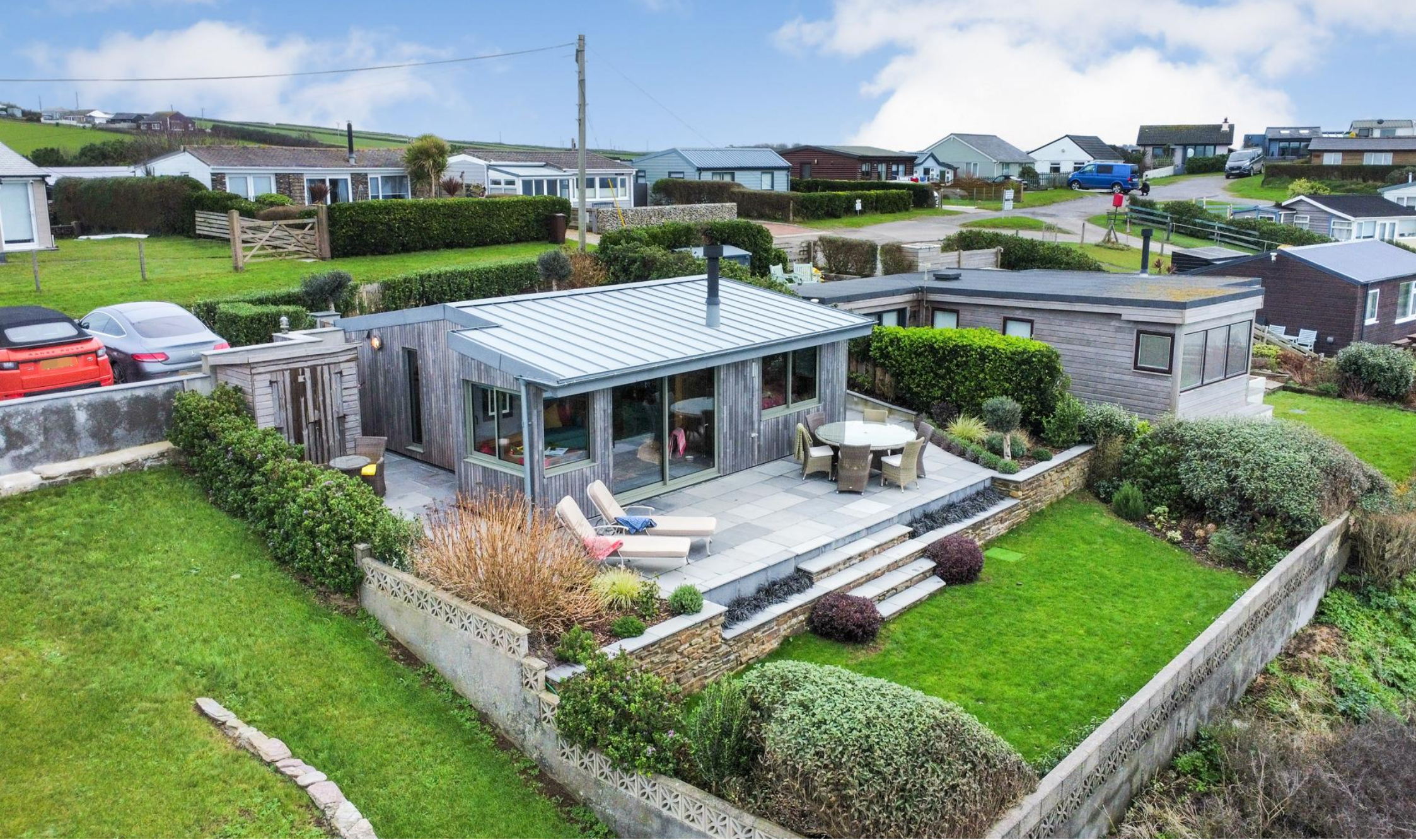
‘Marpen’, Millbrook, Torpoint, Cornwall, PL10 1JN