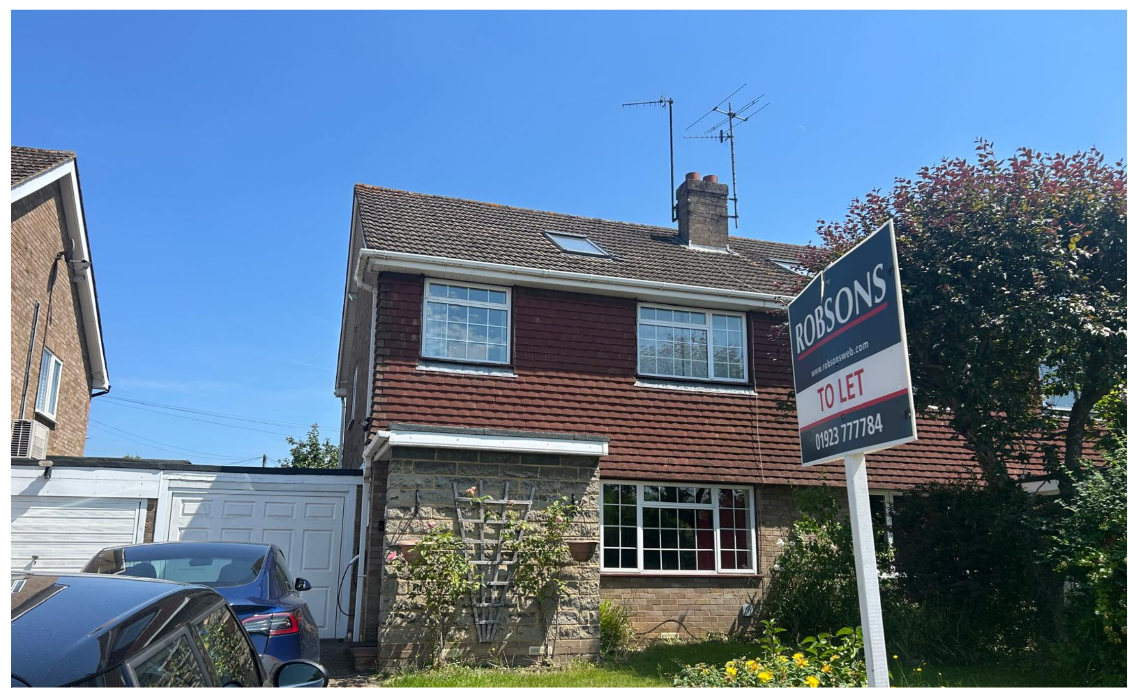
A three bedroom house conveniently situated for local amenities Harefield Road, Rickmansworth, WD3 1NP