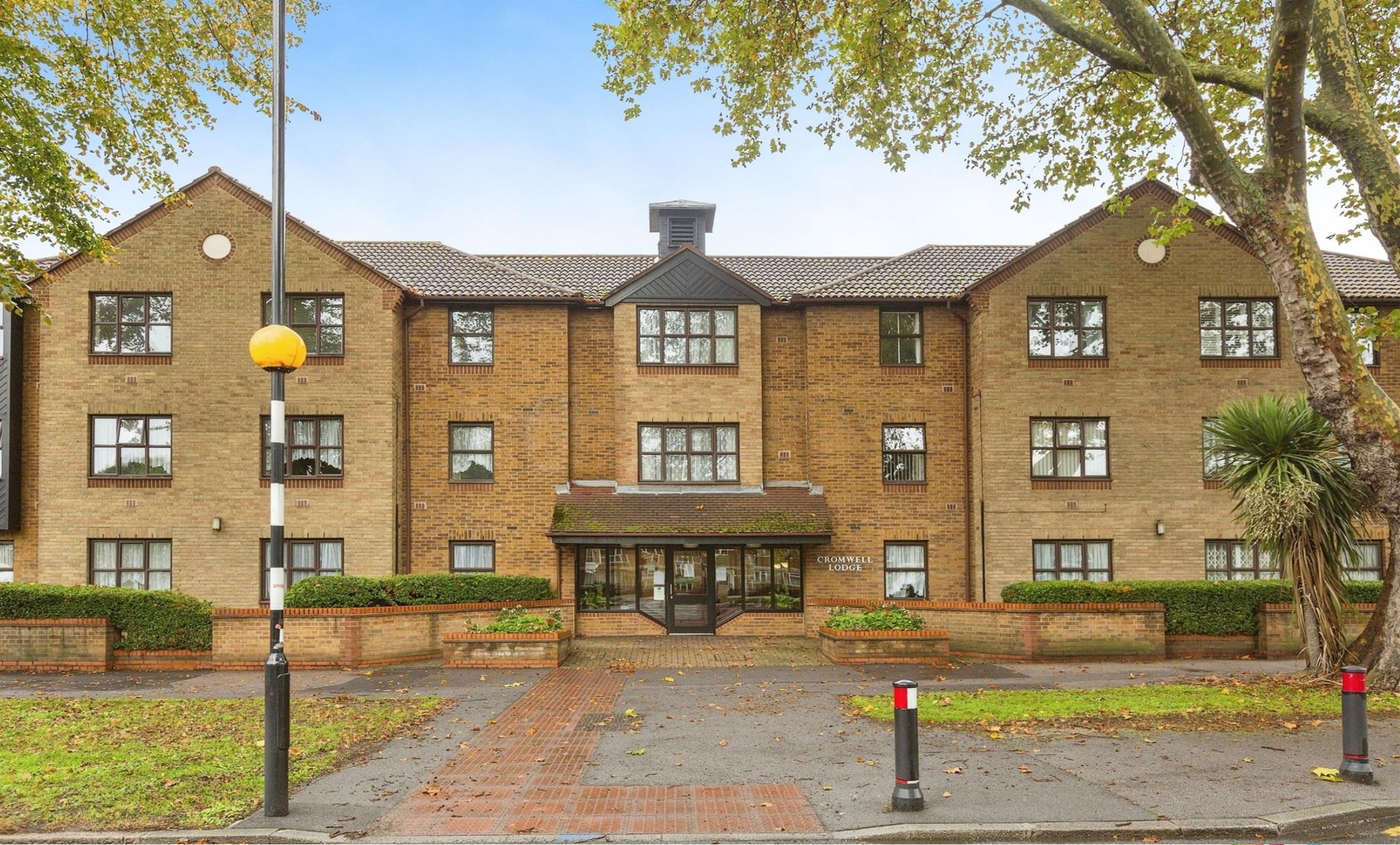
Cromwell Lodge, Longbridge Road, Barking, IG11 8UB