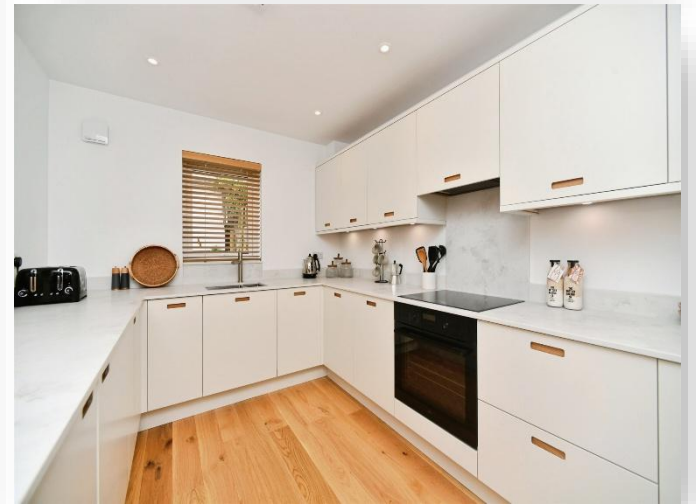
Tavern Row Queens Park Road, Brighton BN2 9ZB