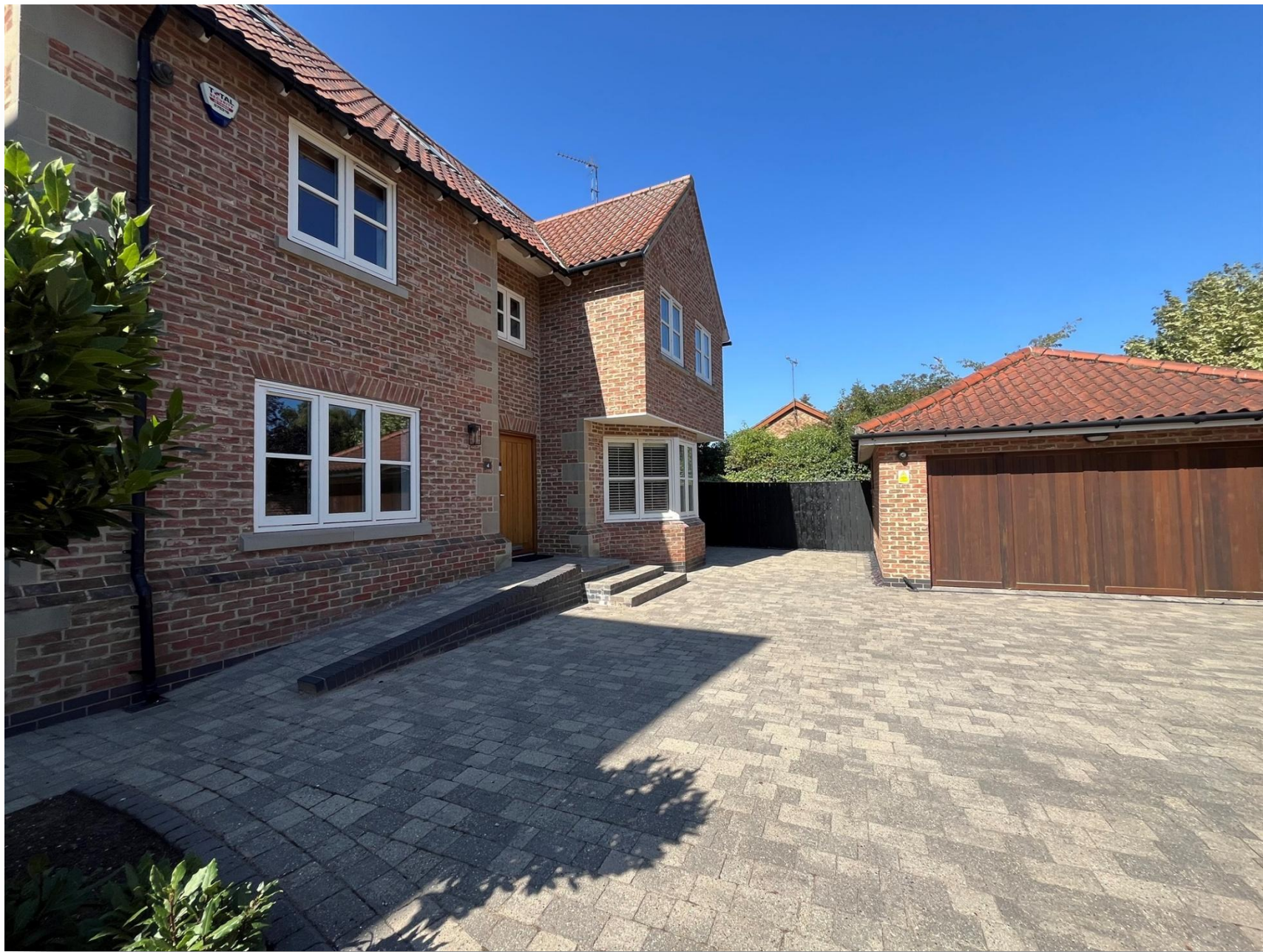
Mere Glen, Leconfield, Beverley, HU17 7LL