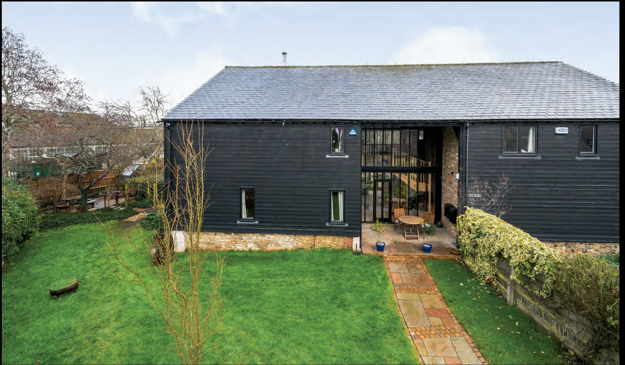
Russet Barn 281 Broadwater Road | West Malling | Kent | ME19 6HT