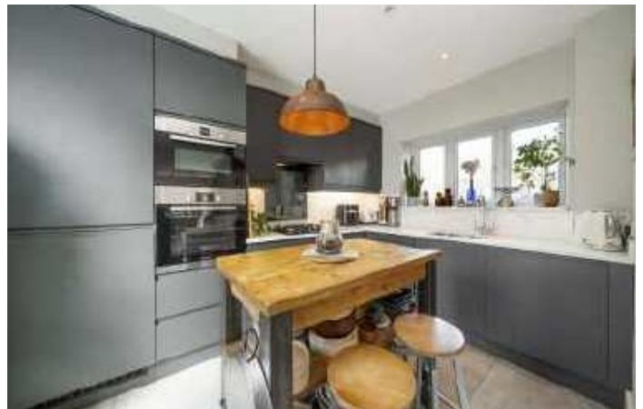
Court Mews, SE13