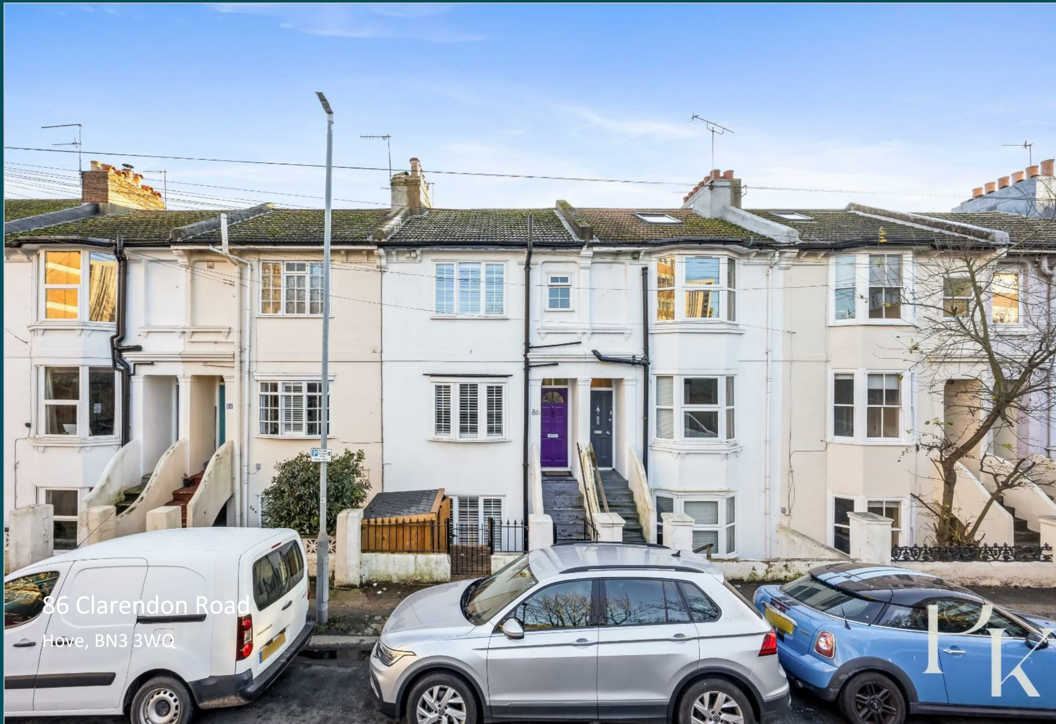
86 Clarendon Road Hove, BN3 3WQ