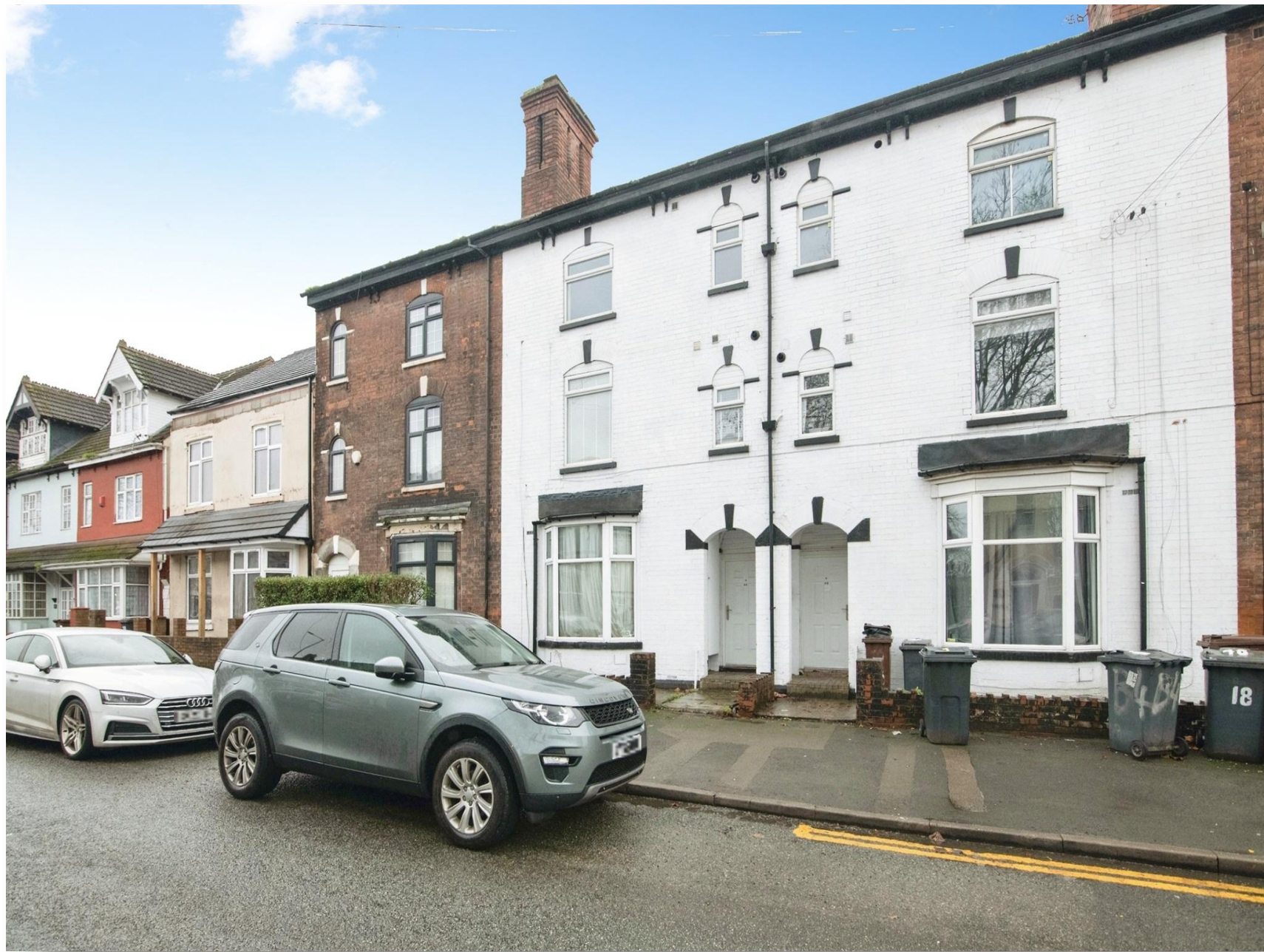
Wellington Road, Bilston WV14 6AG