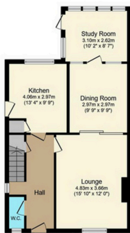
Floor area 60.1 sq.m. (647 sq.ft.) approx