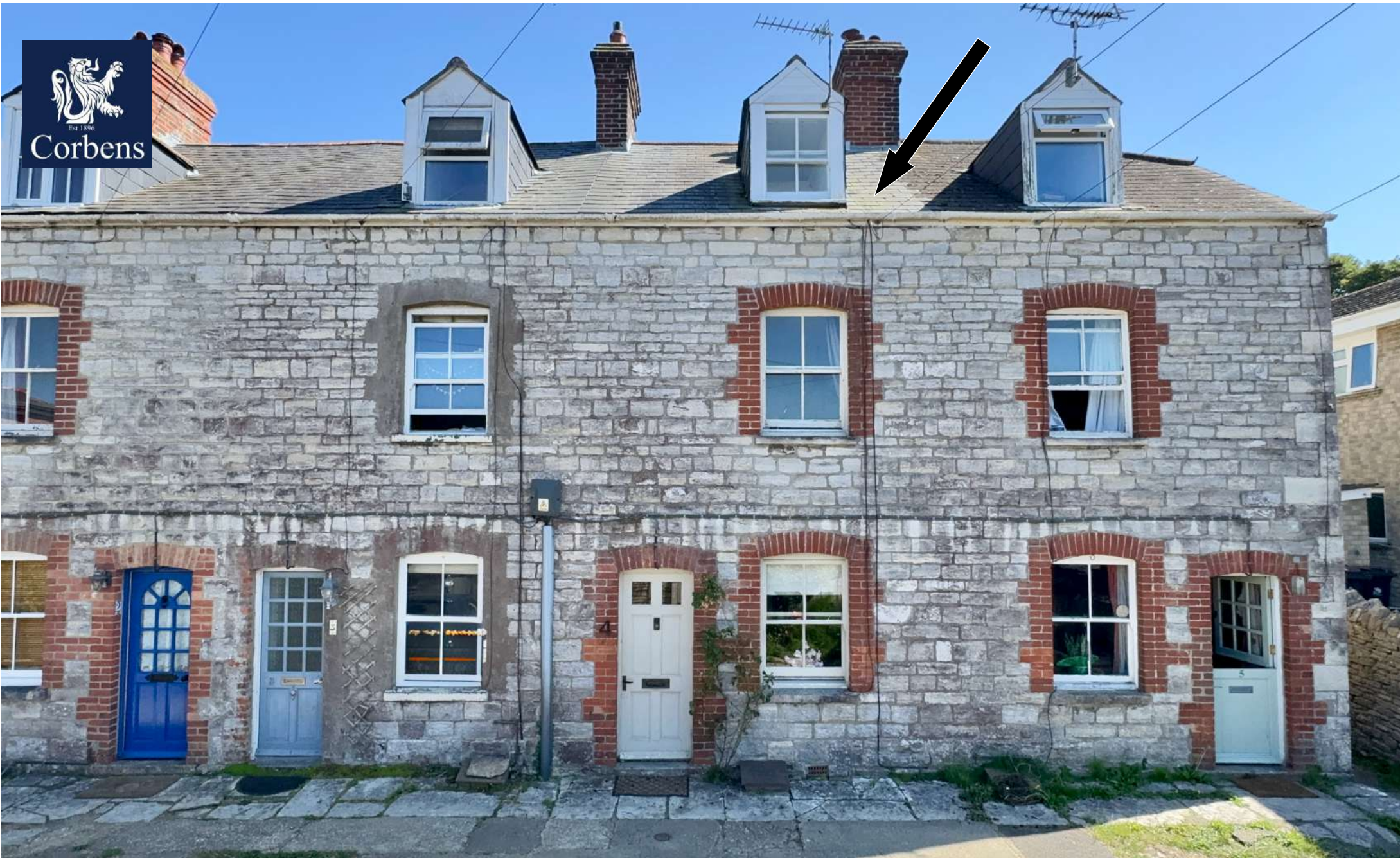
4 ALMA TERRACE, QUEENS ROAD, SWANAGE £365,000 Freehold