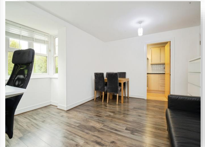
Heol Tre Forys, Penarth, CF64 3RE