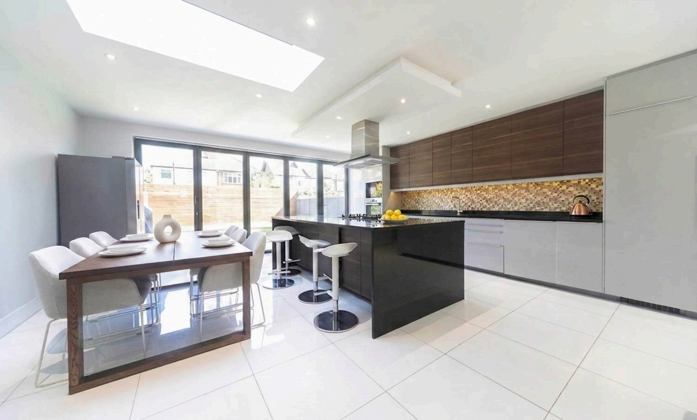
Burnley Road, Dollis Hill, NW10 £4,800 pcm