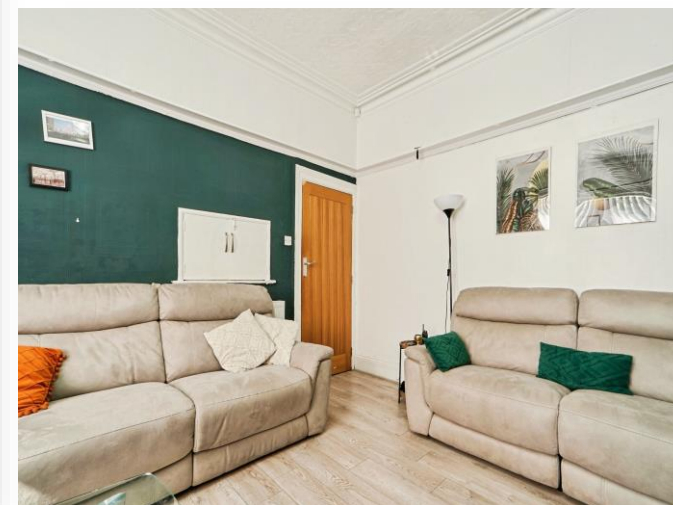
Daisy Hill Lane, Bradford BD9 6BN