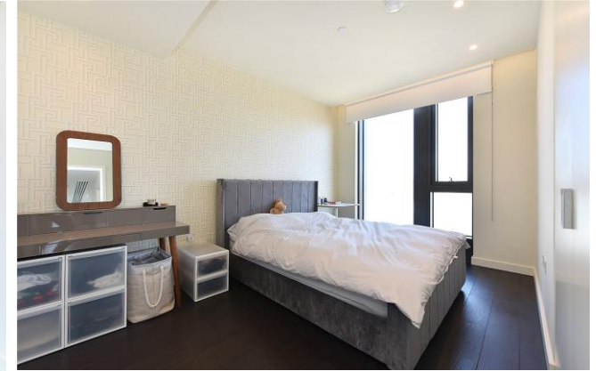
A fantastic two bedroom apartment in the Versace designed DAMAC Tower

Minimum Term: 12 months Deposit Required: £7,061.54 Local Authority: Lambeth Council Tax Band: F EPC Rating: B Furnished