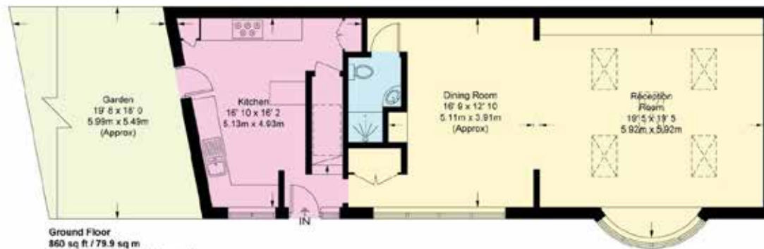
Ground Floor 860 sq ft / 79.9 sq m (Including Reduced Headroom)

Approximate Gross Internal Area = 127.2 sq m / 1,369 sq ft