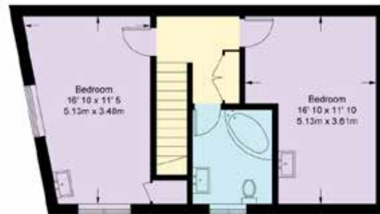
First Floor 600 sq ft / 47.3 sq m