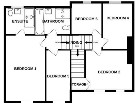
1ST FLOOR 828 sq.ft. (77.0 sq.m.) approx.