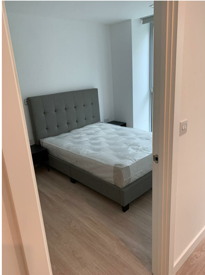
Modern 1B1B Apartment | Affinity Living Riverside | M3 1150015AI PS