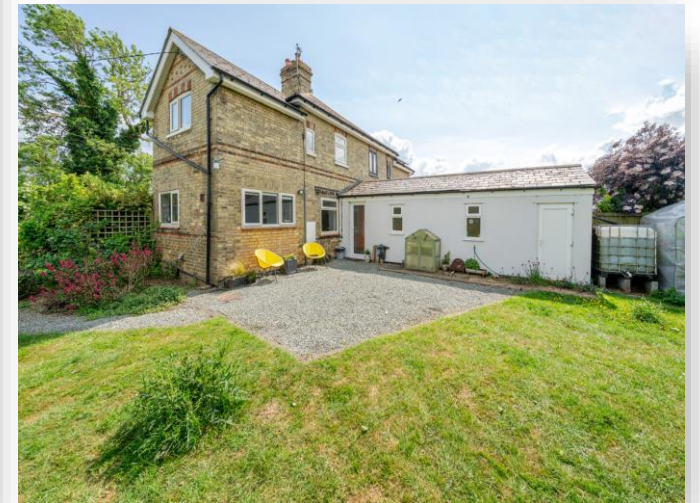
Keyworth Cottage Chase Road, Benwick March PE15 0XS